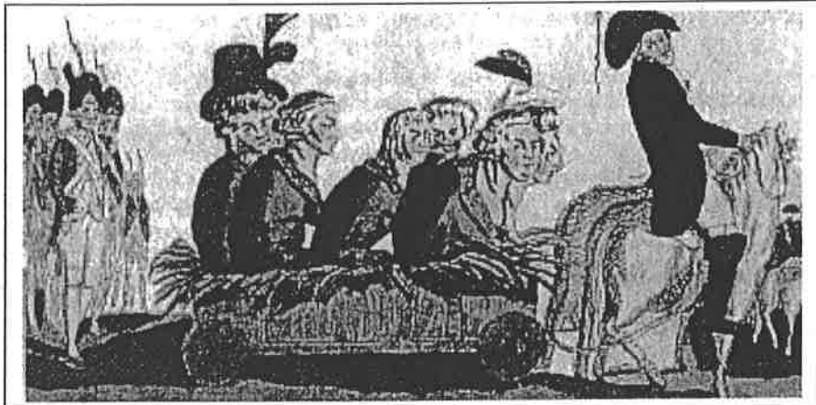
The family of pigs is brought back to the pigsty!