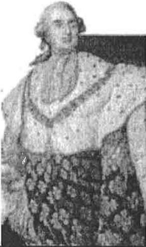
Source A. King Louis XVI of France