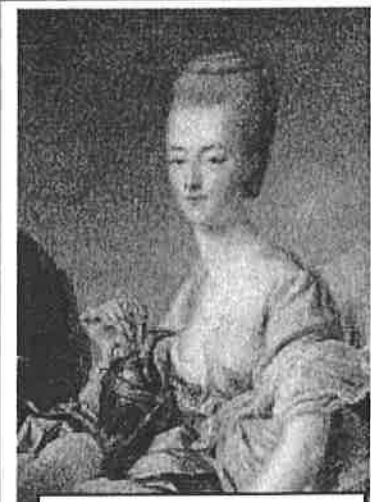
Source C. Queen Marie-Antoinette of France.